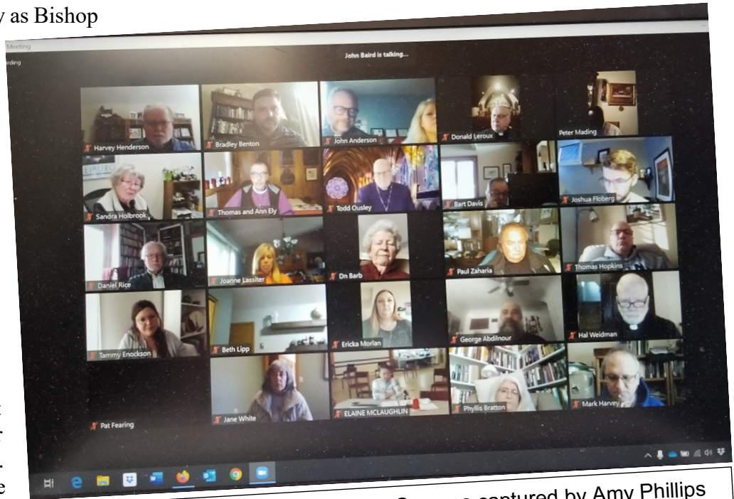
One of the Special Convention Zoom Screens