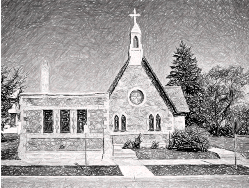
All Saints' Episcopal Church, Valley City

The identifying design features could also include a steeply pitched roof; a distinct chancel; decorated verge boards (a verge board is decorative boarding, also called bargeboard along a projecting roof eave, and is often carved or scrolled, and is highly ornamental); pointed-arch windows; sometimes stained glass; an asymmetrical design; a richly decorated interior; a Gothic window above the entry; and a one-story porch with flattened, Gothic arches. The Episcopal churches constructed in North Dakota usually included one or more of these Gothic architectural features.