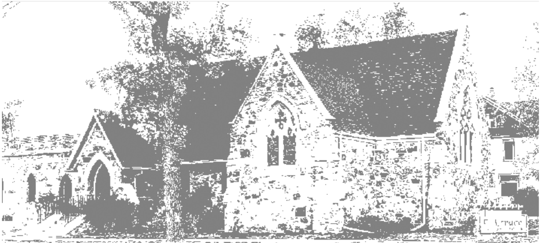
Grace Church, Jamestown - south elevation

constructed fifty-three churches in North Dakota in the years 1874-1922. Most of these churches were built with wood frames, with board-and-batten siding, pointed arch windows, an offset chancel, and a steeple located on the side of the church opposite the chancel.