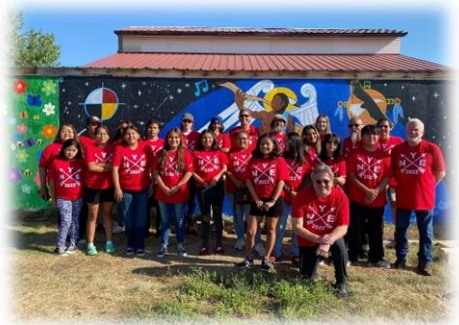
Native Youth Event gathered students from across the U.S.