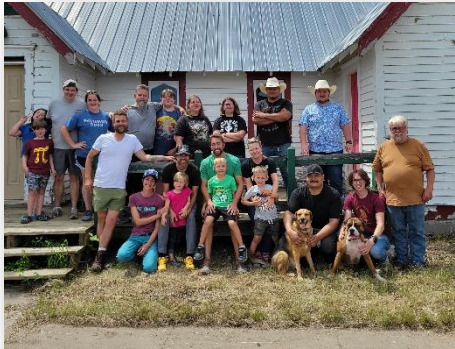
Some of the Pathways Camp Staff gather with their families for a group picture