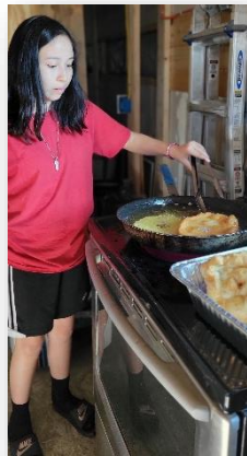
Students learned how to make dream catchers and frybread this summer