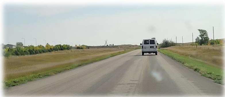
One of the biggest needs we have on Standing Rock are new or used 12 passenger vans. To do what we do consistently every Wednesday, we need transportation. All of the vehicles we have are well over 150,000 miles and continue to need maintenance.