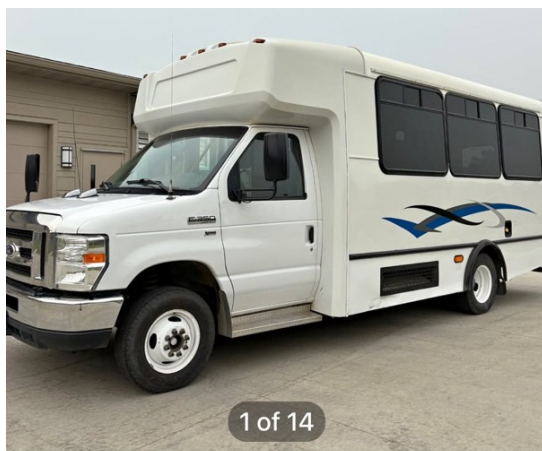
2015 FORD PASSENGER/ WHEELCHAIR BUS - GREAT SHAP...